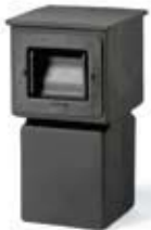
Model PS7000 shown

Model: PS3000 Weir Width: 6" Dimensions: 13"W x 13"D x 25"H Pump Flow Range: 1,000 - 3,000 gph Filtering: net Application: Satellite Skimmer - Drawing and cleaning water from hard-to-reach areas of a pond, the Satellite Skimmer is used in combination with (and plumbs into) the main pond skimmer. PS3000 installs inside or outside the pond. Use with Skimmer: PS7000 / PS15000