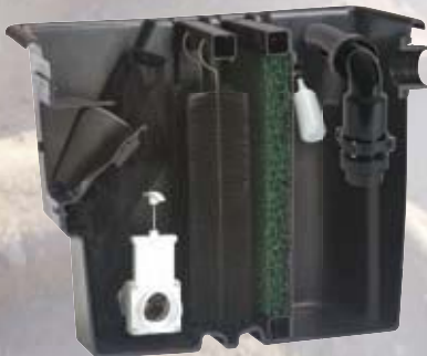
Sectioned PS4600 shown with optional accessories.

NEW! Model: PS15000 Weir Width: 14" Dimensions: 28"W x 33"D x 31"H Max Pump Flow: 15,000 gph Sq. Ft. Rating: 1400 Filtering: net, brush panel Match to FilterFalls: BF3800