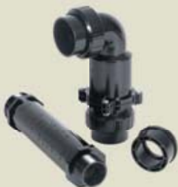
Triton Check Valve