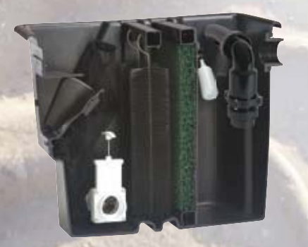
Sectioned PS4600 shown with optional accessories.

Dimensions: 28"W x 33"D x 31"H Max Pump Flow: 15,000 gph Sq. Ft. Rating: 1400 Filtering: net, brush panel Match to FilterFalls: BF3800