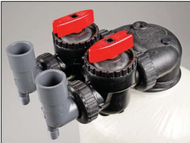
1191 In-Out Head shown with optional V3006 Bypass Assembly and V3007-01 3/4" x 1" PVC Solvent Elbow Assembly