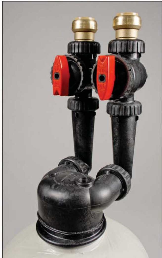
1191 In-Out Head shown with optional V3191-01 Vertical 90° Adapter Kit, V3006 Bypass Assembly and V3007-13 1" SharkBite® Fittings

Note: On upflow service the bypass will give two-way function capabilities (service and bypass). The red bypass handles also need to be reversed to indicate proper service flow direction.