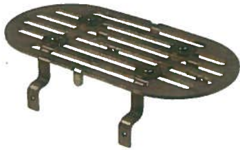
SMALL SKIMMER GRATE WITH EXTENSION RISER