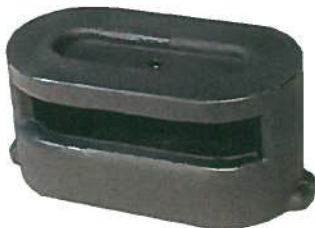
SMALL SKIMMER HOOD

The Extension Riser allows for larger debris to pass below the grate and into the Filter Baskets.