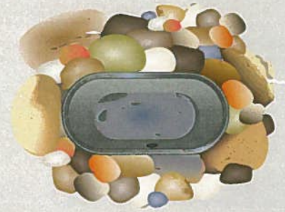
PUMP OFF, DRAINING COMPLETE

All water completely vanishes and is now stored in the Filter Tank reservoir.