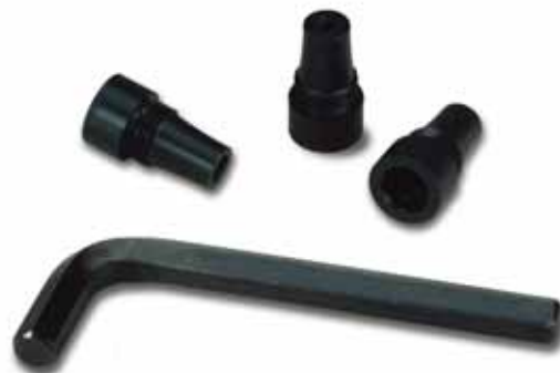
“Quick-Change” Jet Nozzle