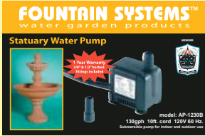
MASTER CARTON: 36 ct. / 50 lbs. Cord: 10'