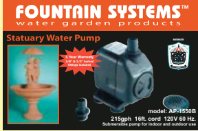
MASTER CARTON: 24 ct. / 61 lbs. Cord: 16'