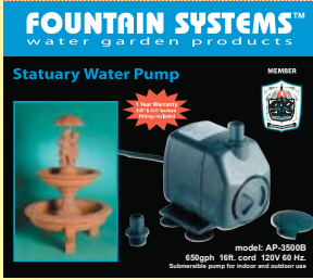
MASTER CARTON: 12 ct. / 54 lbs. Cord: 16'