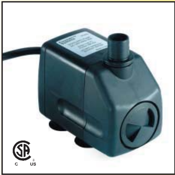
AP3200B 275-315 GPH Magnetic Drive Pump, Fittings