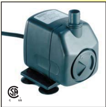
AP3500B 450-520 GPH Magnetic Drive Pump, Fittings