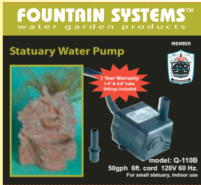
MASTER CARTON: 60 ct. / 50 lbs. Cord: 6'