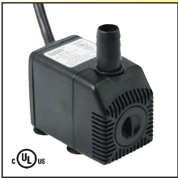
AP1230B 90-101 GPH Magnetic Drive Pump, Fittings