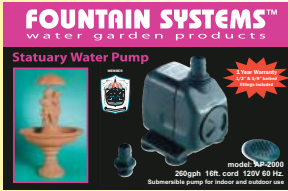
MASTER CARTON: 24 ct. / 78 lbs. Cord: 16'