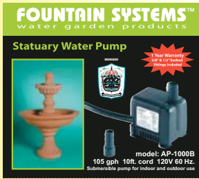
MASTER CARTON: 36 ct. / 49 lbs. Cord: 10'