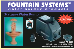
MASTER CARTON: 24 ct. / 81 lbs. Cord: 16'