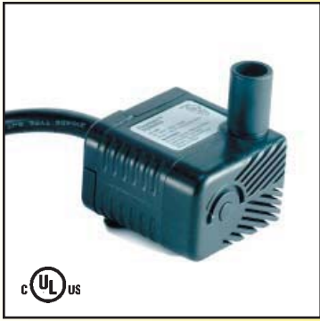
Q112B 45-60 GPH Magnetic Drive Pump, Fittings