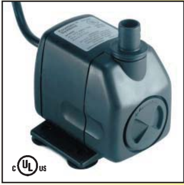
AP2000 180-210 GPH Magnetic Drive Pump, Fittings