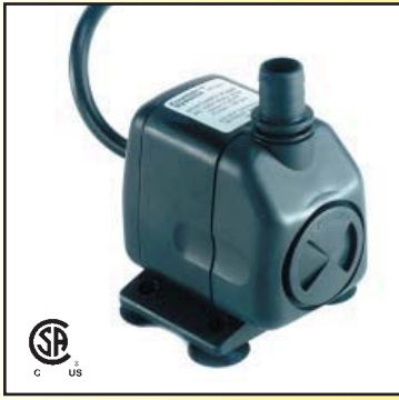
AP1550B 150-170 GPH Magnetic Drive Pump, Fittings