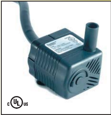
Q110B 25-40 GPH Magnetic Drive Pump, Fittings