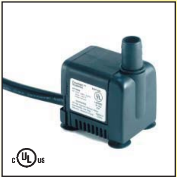
AP1000B 73-82 GPH Magnetic Drive Pump, Fittings