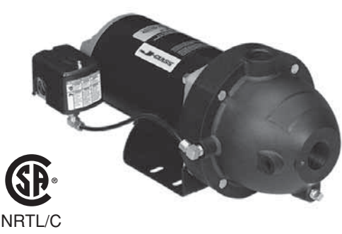
CSA 108 UL 778