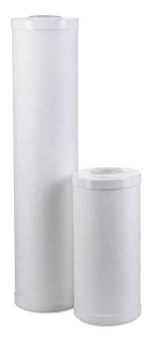
SDP SERIES - 4.5" Diameter Cartridges

NOTE: The granular activated carbon cartridges will contain a very small amount of carbon fines (very refined black powder). After installation, a new cartrige should be flushed with sufficient water to remove all traces of the fines from your water system before using the water. Each time you use your filtered water tap for drinking or cooking purposes it is recommended that you run (flush) the tap for at least 20 seconds prior to using water. This is particularly important if the water tap has not been used daily.