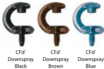
CFd® Downspray Black