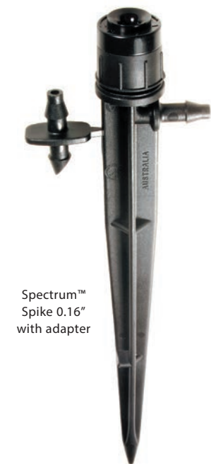
Spectrum™ Spike 0.16" with adapter