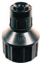
Spectrum™ Thread 1/2"