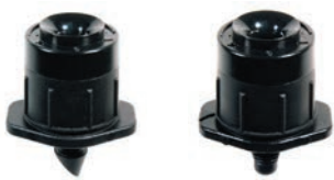
Spectrum™ Barb 0.16"