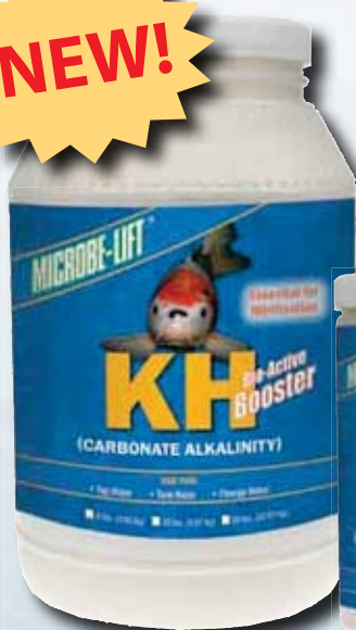
8 lbs. (3.62 kg.)