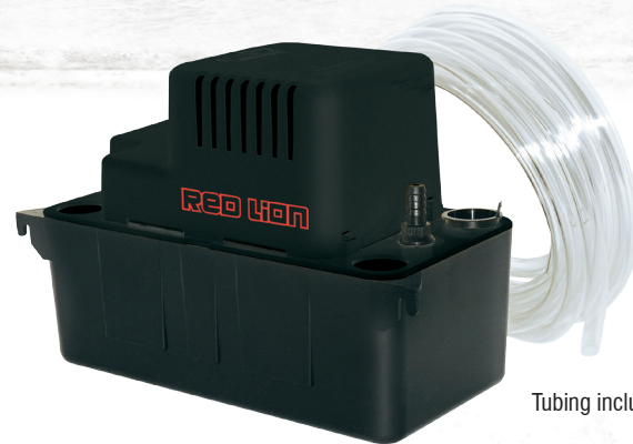
Tubing included with C20ST