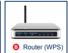
B Router (WPS)

WiFi: Requires a WiFi connection with push button WiFi Protected Setup (WPS) functionality.