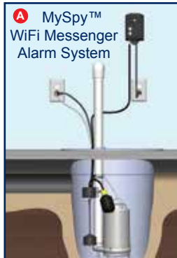
A MySpy™ WiFi Messenger Alarm System